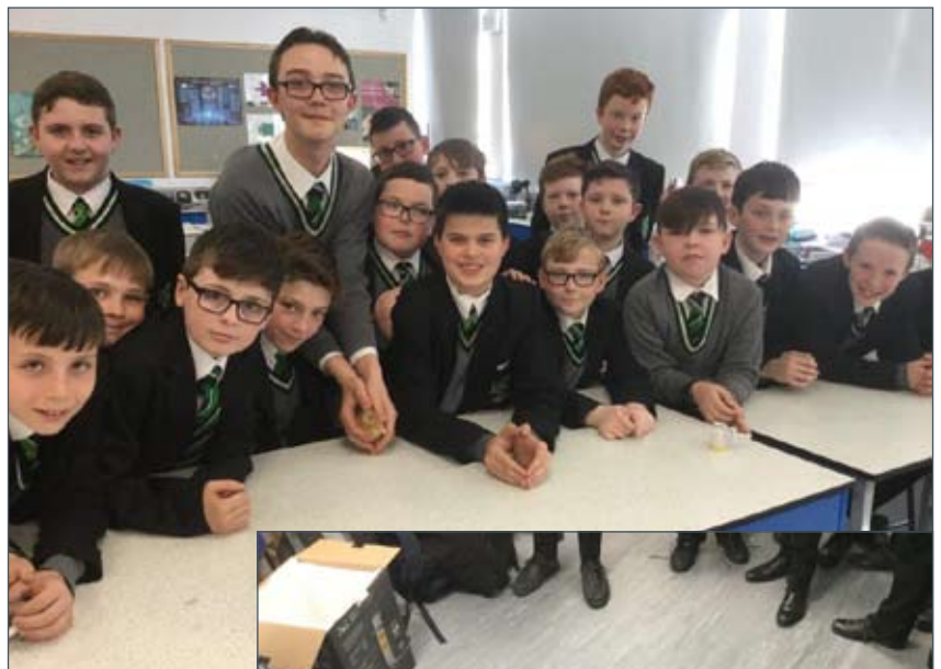
Above: Boys enjoying Friday lunch time Zoology Club

Next year we will hopefully get some gerbils and rats to breed. We have also had ducklings visiting Science Club, and in the coming weeks we hope to have a young lamb joining us!