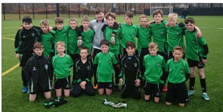
The Year 8 team have enjoyed great success this year.