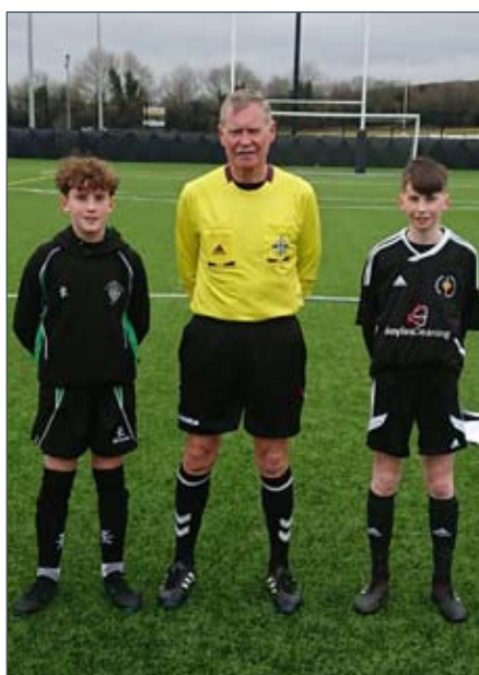
The Captains ready for the Final