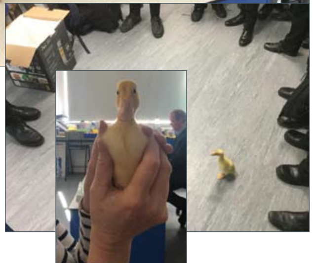
Right: Ducklings visited the Zoology Club